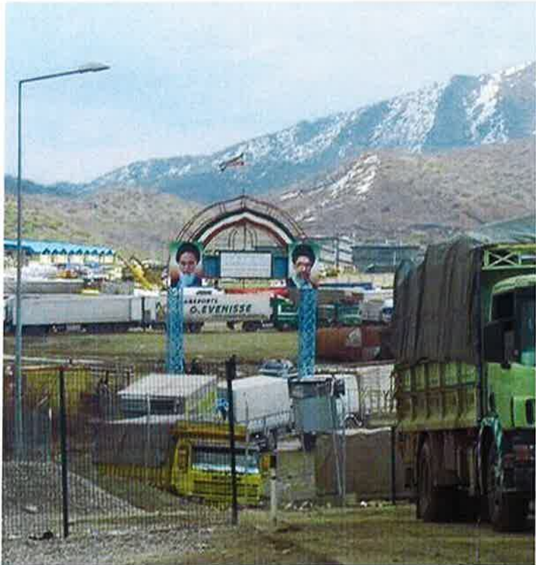
Trucks at the Turkey - Iraq border