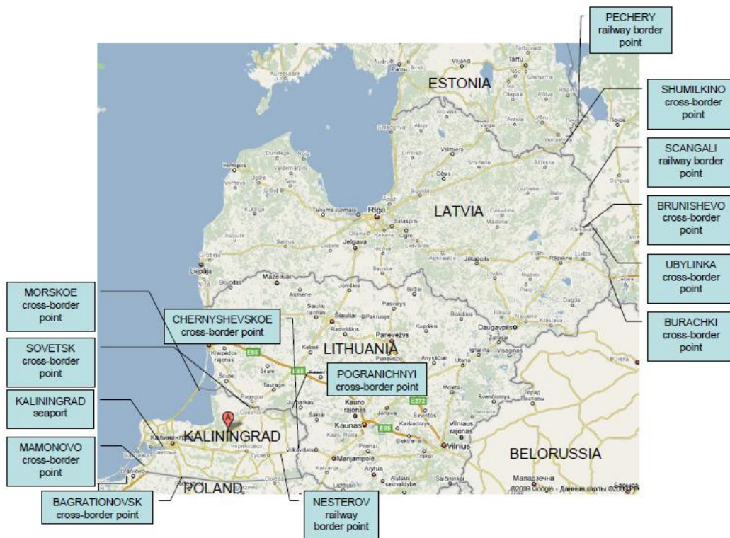
Russian Customs Border-Crossings in Pskov and Kaliningrad Regions Used to Smuggle Saint George